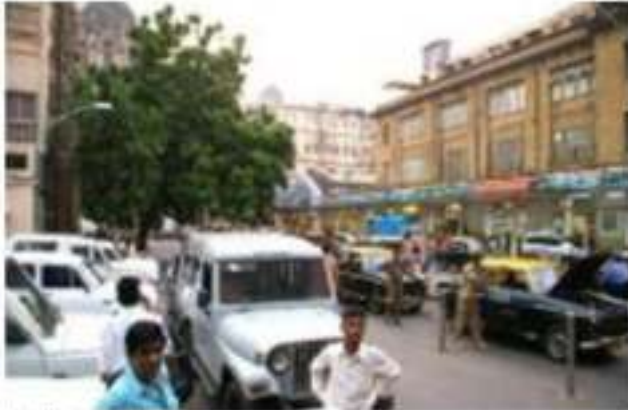
Mumbai's Chhatrapati Shivaji Maharaj Terminus

The inspiration was an aerial photograph of the grand Mumbai CSMT station building and complex taken by an Englishman A. R. Hasler in the 1930s