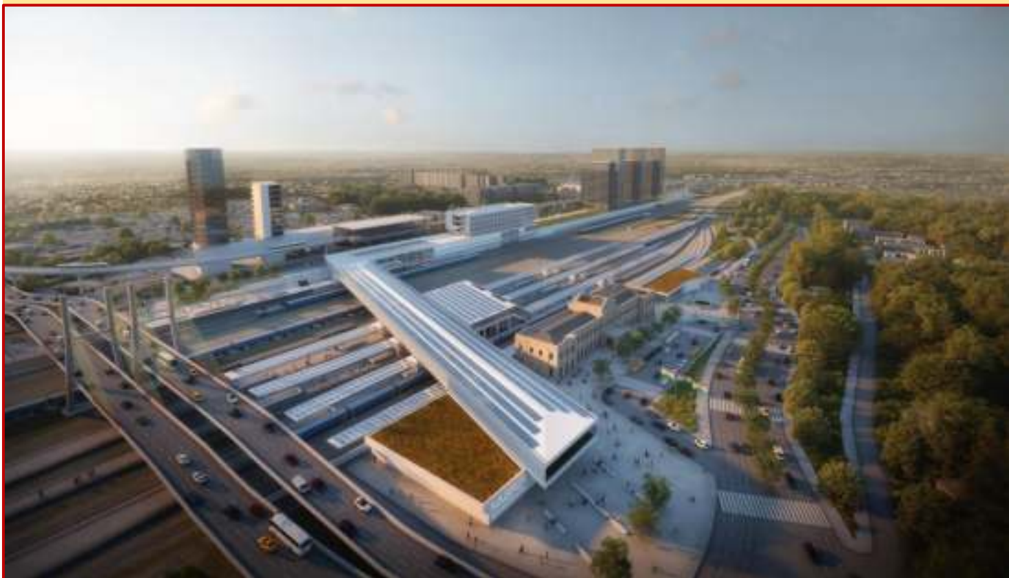
Proposed view of Nagpur Railway Station after redevelopment