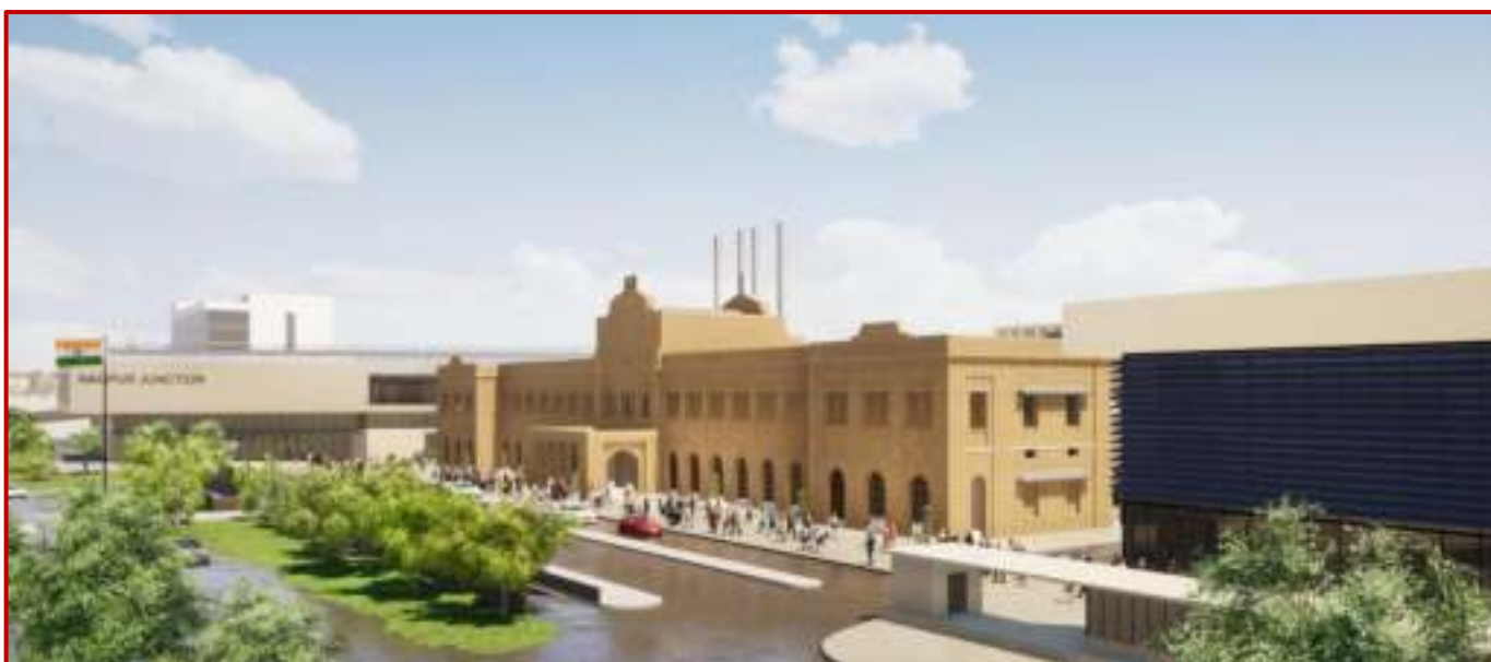
Proposed view from Tekdi Road