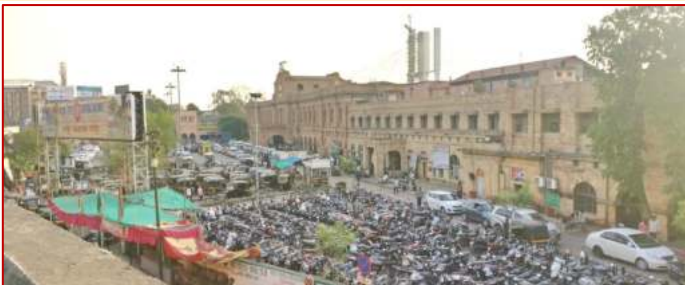
Existing view from Tekdi Road

In order to de-risk the project, IRSDC processes to obtain approval. As part of same, IRSDC submitted a detailed proposal to Nagpur Municipal Corporation and "Heritage Impact Plan" to Heritage Conservation Committee, Nagpur. The Heritage Conservation Committee consisting of eminent architects, engineers and environmentalists considered this proposal on 13.08.2020. Presentation was made by the project French Architects firm M/s. ENIA Design private ltd, and IRSDC by video conferencing due to Covid-19 circumstances. The committee in-principally approved the proposal during the meeting itself. Minutes are awaited.